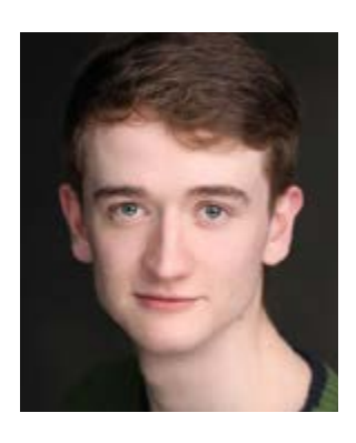
Angus Taylor Declan

Shauna has worked extensively across theatre, television and film, including performances in Born to Run (Traverse Theatre Company), King Lear and Pal Joey (Citizens Theatre), The Cry (BBC), In Plain Sight (ITV), The Five (Sky), and films Star Wars: The Last Jedi (2017), The Descent (2005), The Descent: Part 2 (2009) and Filth (2013).